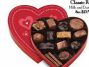
Classic Red Heart Milk and Tiramisu $12.99 - #100