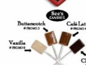
Buttercotch #10032 Vanilla #10033 Cafe Latte #10034 Chocolate #10035 Lollipops $1.00 each